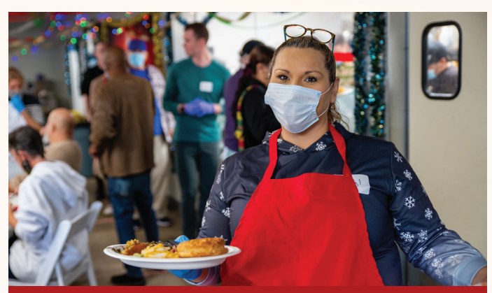
Festive, filling, and fun, the Christmas Feast is open to anyone in need in our community.